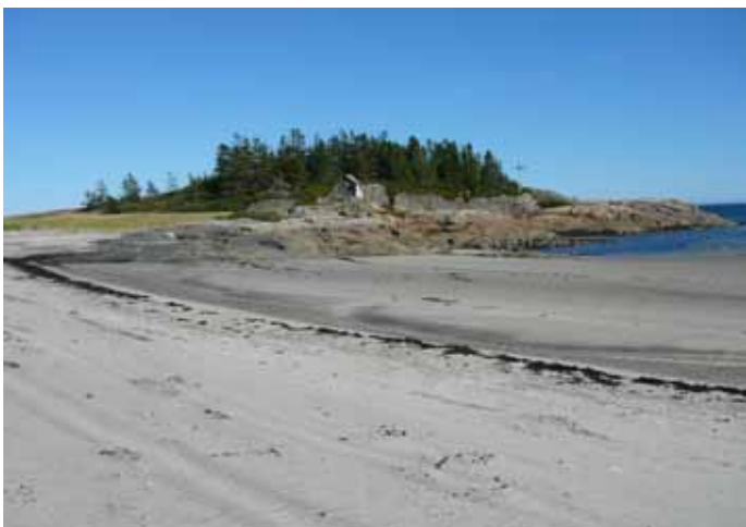
Les Îlets-Caribou, North Shore (Andrew P. Coughlan)

The survey area stretches from Tadoussac to Sept-Îles along the northern shore of the Estuary and Gulf, and from Cacouna in the Bas-Saint-Laurent region on the southern shore, around the Gaspé Peninsula to Newport, and then out to the Magdalen Islands. The program, which uses the same protocol as that used in BC, complements data generated by other surveys that were historically conducted in the Maritimes, and along the Lower North Shore of Québec and the Labrador and Newfoundland coasts. Surveying in Québec is largely limited to the period from May to October, when the shores are free of ice and snow, and this also covers the period when shipping is most active.