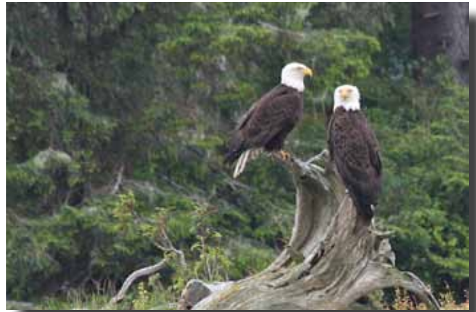
Bald Eagles (T. Hobley)