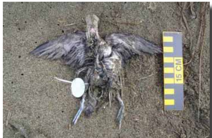
Cassin's Auklet found at Cape Beale Lighthouse Station in November 2014 (K. Zacharuk)