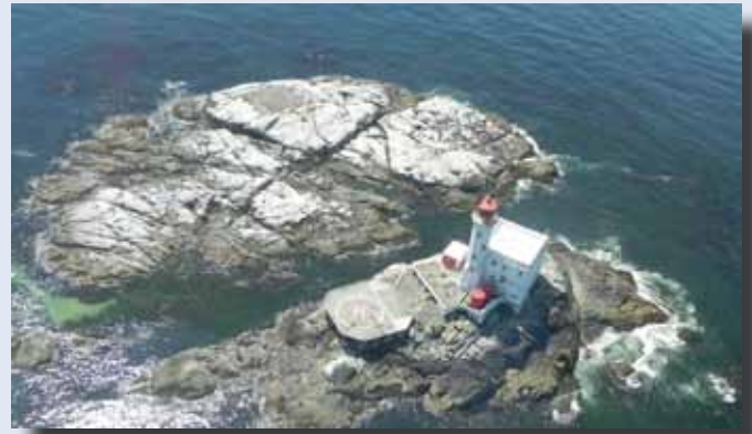
Triple Island Lighthouse Station, Coastal Waterbird Survey site (R. Neftin)