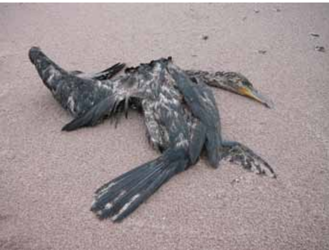
Double-crested Cormorant