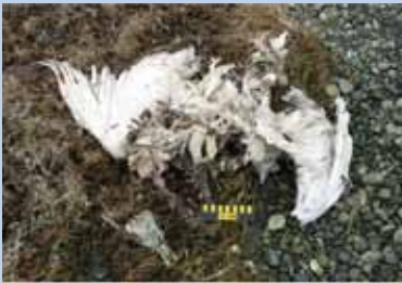
Swan carcass