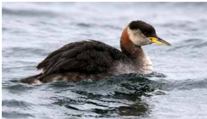
Red-necked Grebe (R. Hocken)

Large flocks of Western Grebe are not seen as often in the southern Strait of Georgia compared to many years ago. Studies indicate that Western Grebe have shifted their winter distribution southwards to California. However, good numbers were regularly observed during 2013-14 at a site in Viner River estuary in the Broughton Archipelago (Yvonne Maximchuk and Bill Proctor). Over 700 Western Grebe were recorded in this area during October 2013, December 2013, and January-March 2014. Red-necked Grebe were seen at most sites throughout the BC coast. Counts over 100 Red-necked Grebe occurred in September 2014 at Comox, White Rock and Denman Island with a maximum count of over 600 at White Rock (Leona Breckenridge and Alison Prentice). Horned Grebe were recorded at many sites and were most abundant at Cordova Bay in Victoria, Kitty Coleman-Seal Bay in Comox, Denman Island and Nanaimo.