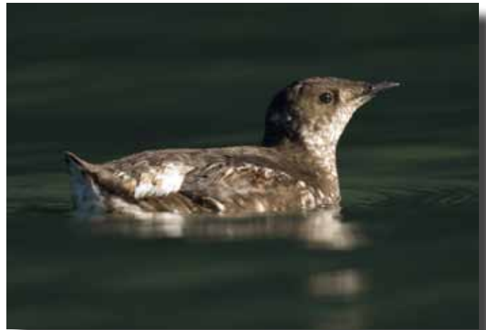
Marbled Murrelet