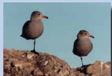
Heermann's Gulls