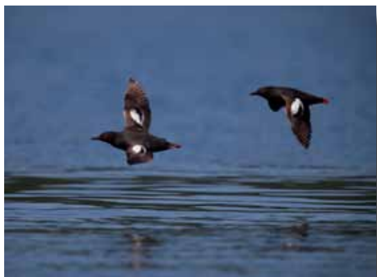
Pigeon Guillemot (T. Middleton)