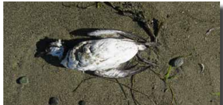
Common Murre found at Cape Beale Lighthouse Station in October 2014