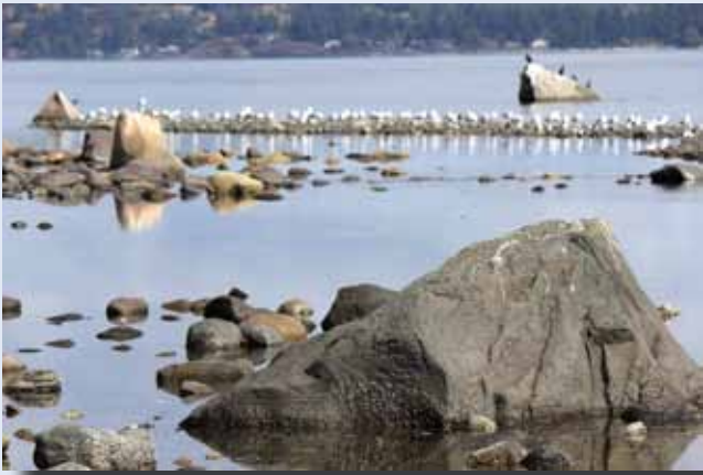
Discovery Beach, Campbell River, Beached Bird Survey site (D. Ross Fisher)