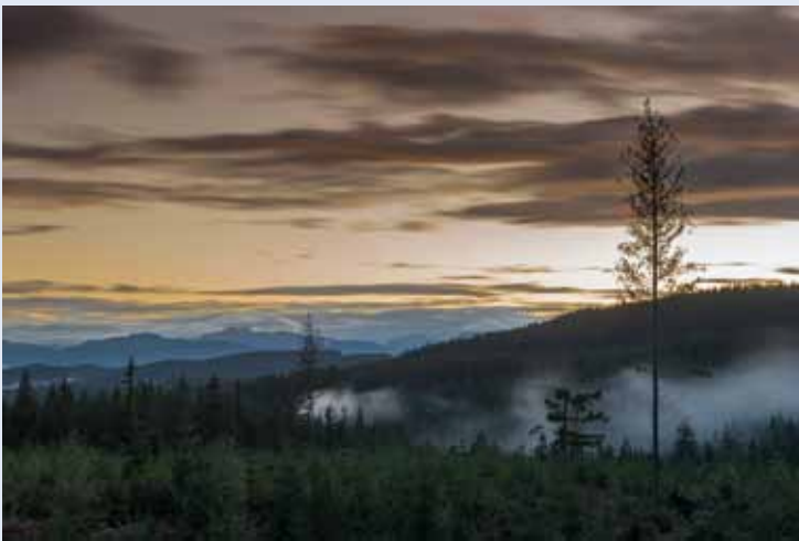
Coastal BC beauty (N. Boyle)