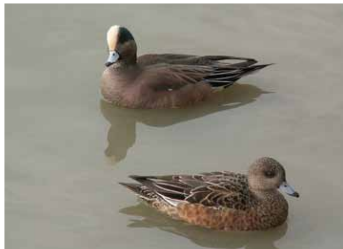
American Wigeon