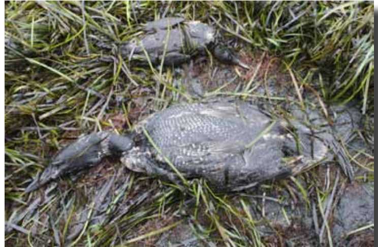
Common Murre and Common Loon found at Boundary Bay in late August 2014 (T. Carr)

In November and December, higher than normal numbers of Cassin's Auklets were found on some west coast Vancouver Island beaches, and large numbers of young of the year Cassin's Auklets washed up along beaches in Washington, Oregon and California (as of Nov 19th, an estimated 500 birds had been reported). The poor body condition of the birds, their young age and involvement of only a single species suggests that these birds died from starvation. The 2014 breeding season saw the highest recruitment ever for Cassin's Auklets (98% fledging success on Triangle Island), so there are many young birds competing for a lower than normal amount of krill. Further details on this event have been published in the article "Large-scale die-off of small seabird along Sonoma Coast" ( http://www.pressdemocrat.com/news/3145997-181/large-scale-die-off-of-small-seabird?page=0 or tinyurl.com/n7cb98x ).