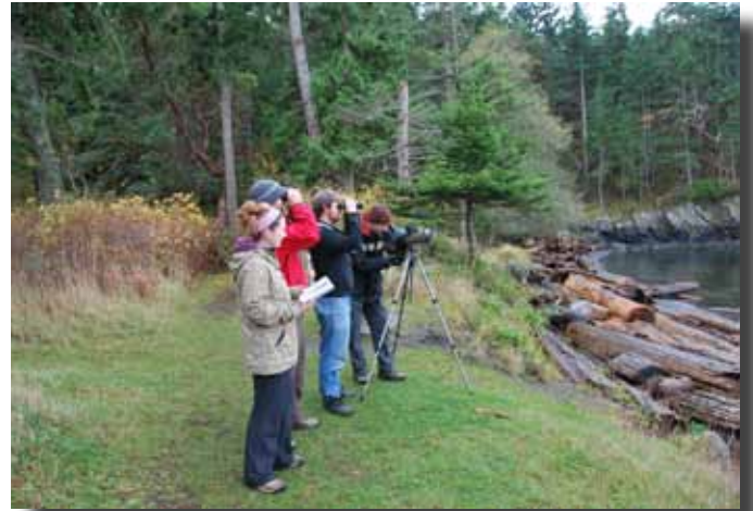
Coastal Waterbird Survey at Neck Point

The results of the analysis were consistent with this hypothesis, revealing that 93% of declining species were diving birds such as loons, grebes, and alcids (murre, auklets and puffins). In contrast, 64% of the birds showing an increasing trend were surface-feeding birds such as ducks, gulls and geese, whereas only 36% were diving birds. The team also addressed the association between declines in count numbers and foraging strategy, dietary specialization, and whether the species breeds locally. They found that diving birds wintering in the Salish Sea were approximately 11 times more likely to have undergone declines than non-diving birds. Furthermore, bird species feeding on fish were 8 times more likely to have undergone declines than those that do not feed on fish. Even for birds that feed on fish, those that dive deeply and do not feed on demersal fish (i.e. on or near the sea floor) were 16 times more likely to have undergone declines than birds that do feed on demersal fish. Local-breeding status also influenced a species' likelihood of decline; those birds that bred locally were 3 times less likely to have undergone declines than non-local breeding birds.