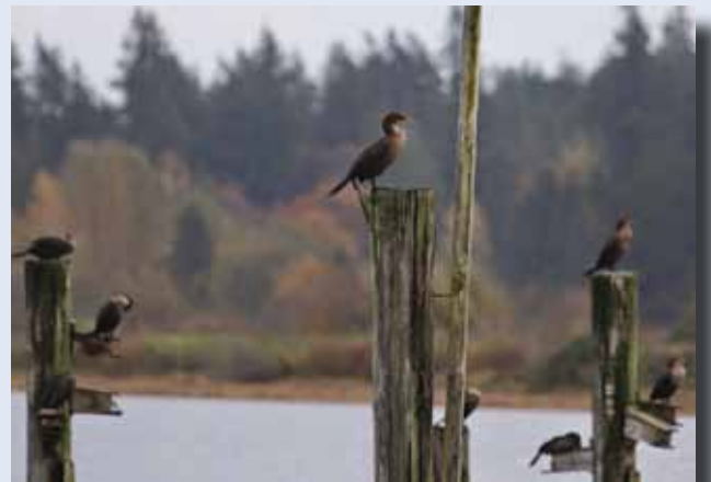
Double-crested Cormorants in South Surrey/White Rock (T. Carr)

Printed on FSC 100% post- consumer fibre. Please pass this on when finished!