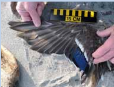
Mallard wing (D. Kramer)