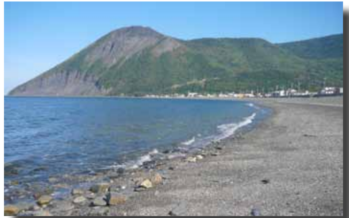
Mont-Saint-Pierre, Gaspé Peninsula

The Québec Beached Bird Survey was initiated because it was felt that birds and other wildlife in this area may be at risk from the illegal dumping of oily bilge waste. The region also houses several potentially important hydrocarbon reserves, and there are current plans to develop an oil terminal port at a site situated at the southwestern extremity of the Beached Bird survey area. Therefore, the survey not only monitors the state