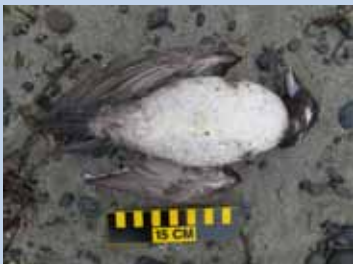
Beached Bufflehead (P. Fafard)