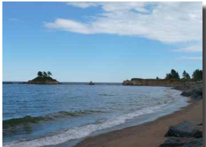
L'Anse-à-Blondel, Newport