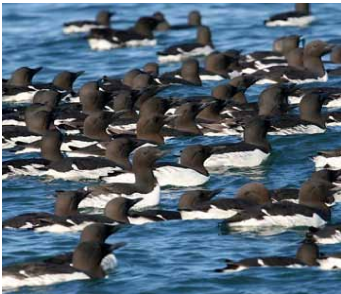
Piscivorous diving birds specializing on forage fish and without local breeding colonies (e.g., Common Murres) had the highest probability of undergoing declines