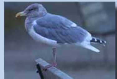
Thayer's Gull (T. Carr)