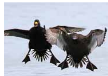
Black Scoters (R. Hocken)