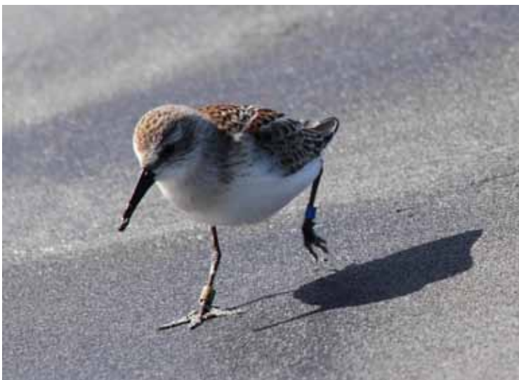
Western Sandpiper