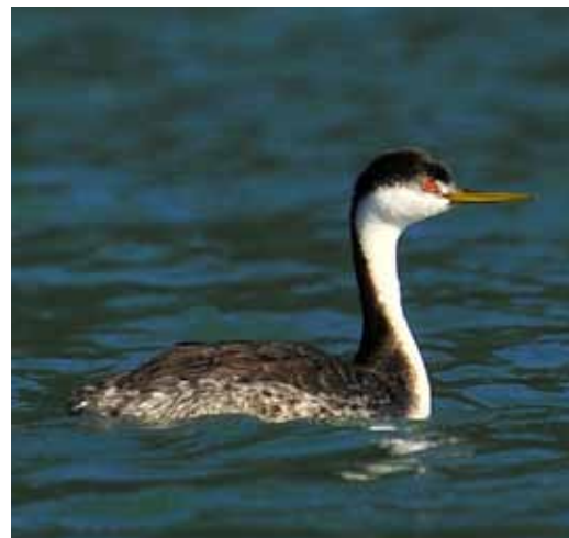
Western Grebe