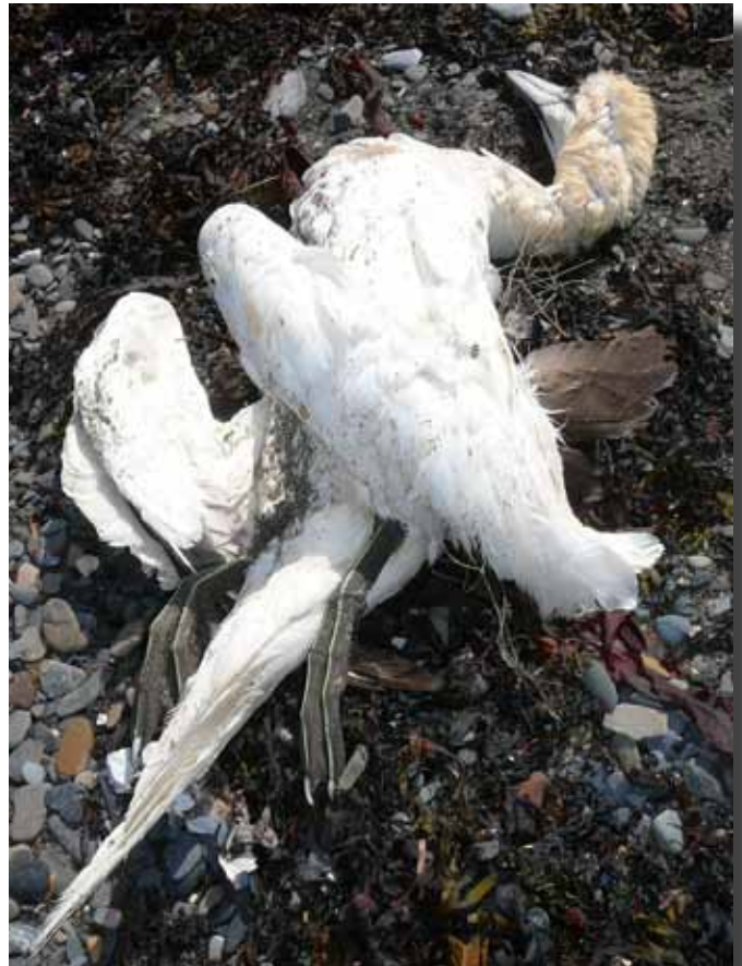
Northern Gannet (Andrew P. Coughlan)

Most of the beaches in the survey are typically infrequently visited by ornithologists. Therefore, as well as providing information on dead birds, participants are also helping to provide valuable information on the use of the study sites by live birds, with over 150 checklist covering about 45 000 live birds being submitted annually. The fact that there are no reports from participants of oil having been deposited on the surveyed beaches and only two oiled birds have been encountered since the start of the program, suggests that the Estuary and Gulf of Saint Lawrence, and the extensive shoreline that borders it, can currently be given a generally clean bill of health in terms of illegal dumping of bilge waste.