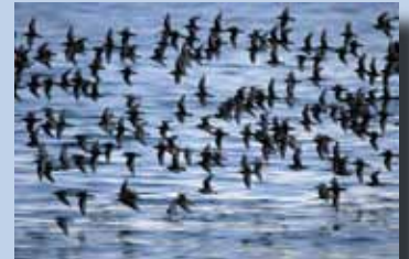
Flock of shorebirds (U. Easterbrook)