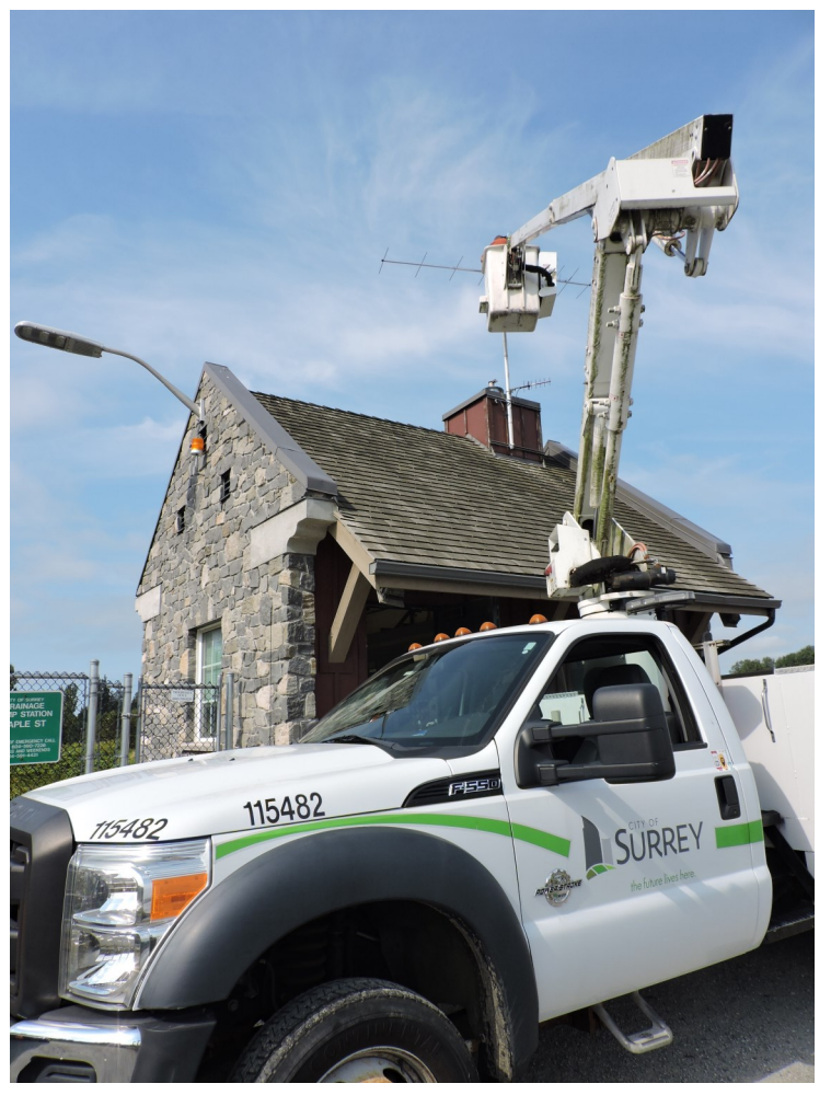
The City of Surrey helping to install a Motus receiver station at Blackie Spit.

Once the transmitters were on the Dunlin, we needed receiver stations that could detect those tagged birds. This is where the collaborative nature of Motus really came into play. The key to the success of Motus is that all tagged birds can be detected on anyone's receiver. Therefore, the Dunlin we tagged can be detected on receivers maintained by Environment and Climate Change Canada that were already in the area. We also installed two new receivers along Mud Bay and Boundary Bay in collaboration with the City of Surrey and Metro Vancouver Regional Parks. Environment