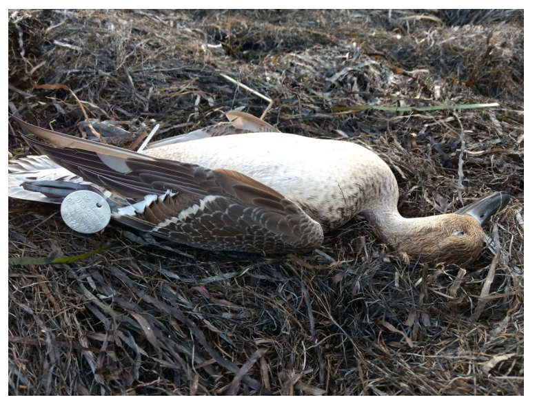
Northern Pintail in Boundary Bay.

The BC Beached Bird Survey is nearing its 20th contin-