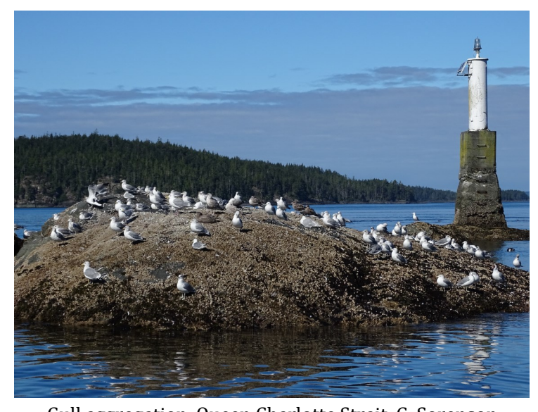
Gull aggregation, Queen Charlotte Strait