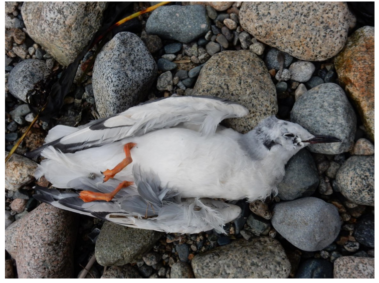
Bonaparte's Gull from Beached Bird Survey, Kitty Castle

The Beached Bird and Coastal Waterbird Surveys of Birds Canada are supported by: