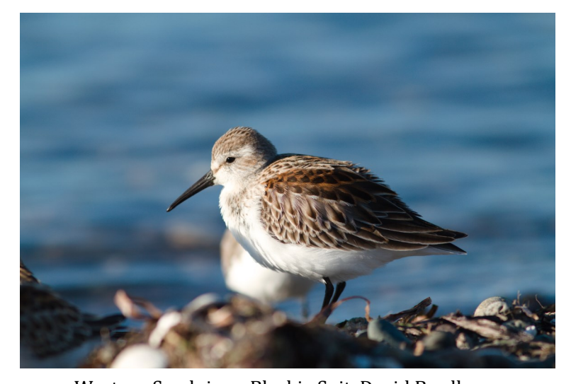
Western Sandpiper, Blackie Spit