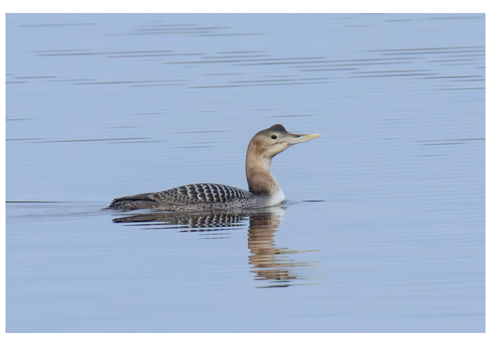
Yellow-billed Loon in Surrey.

In this past season, 170 observers (with 375 assistants) did 1300 surveys at 234 sites across BC! One hundred and eight target species (waterbirds, raptors, and corvids) were detected. Some highlights from the season include; a Yellow-billed Loon near Roberts Creek in November 2019, a Long-billed Curlew at Blackie Spit in October 2019, and a Parasitic Jaeger off Neville Point in September 2019.