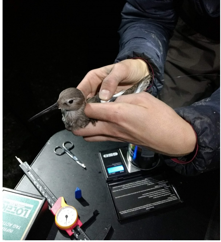
Equipping a Dunlin with a radio transmitter.

The Fraser Estuary supports globally significant numbers of Dunlin during migration and over the winter. Already an urban area, it is under further threat from proposed container terminal expansion. Recently, Birds Canada started a new research project studying the distance and frequency of Dunlin movements to