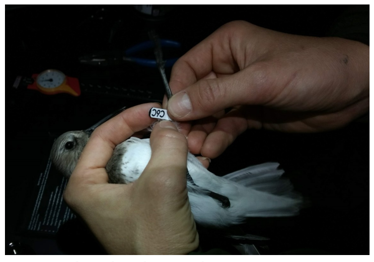
Leg flagged Dunlin, Boundary Bay