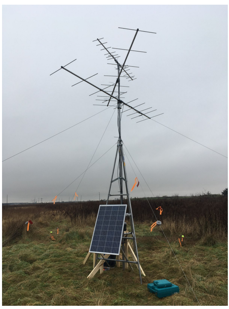
Motus receiver station on Boundary Bay installed in collaboration with Metro Vancouver Regional Parks.

and Climate Change Canada is planning to install several new receivers along the Strait of Georgia for research on Western Sandpiper that may also detect tagged Dunlin. Likewise, the receivers we install for Dunlin research may also benefit their Western Sandpiper work.