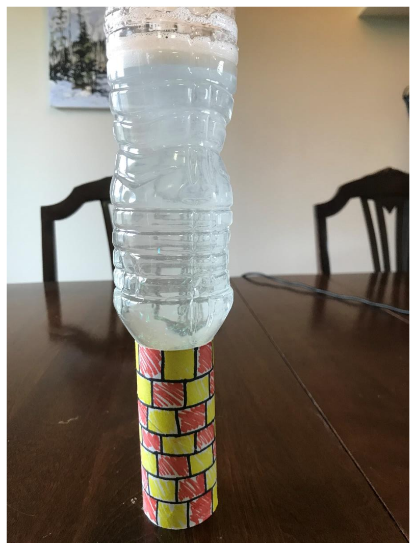
Swiftnado bottle experiment