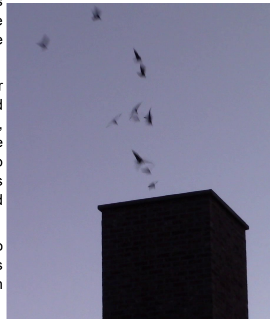
Chimney Swifts drop into a newly constructed artificial roosting tower in Bridgetown, NS